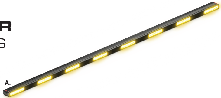
A. Fusion® Amber Rocker Panels